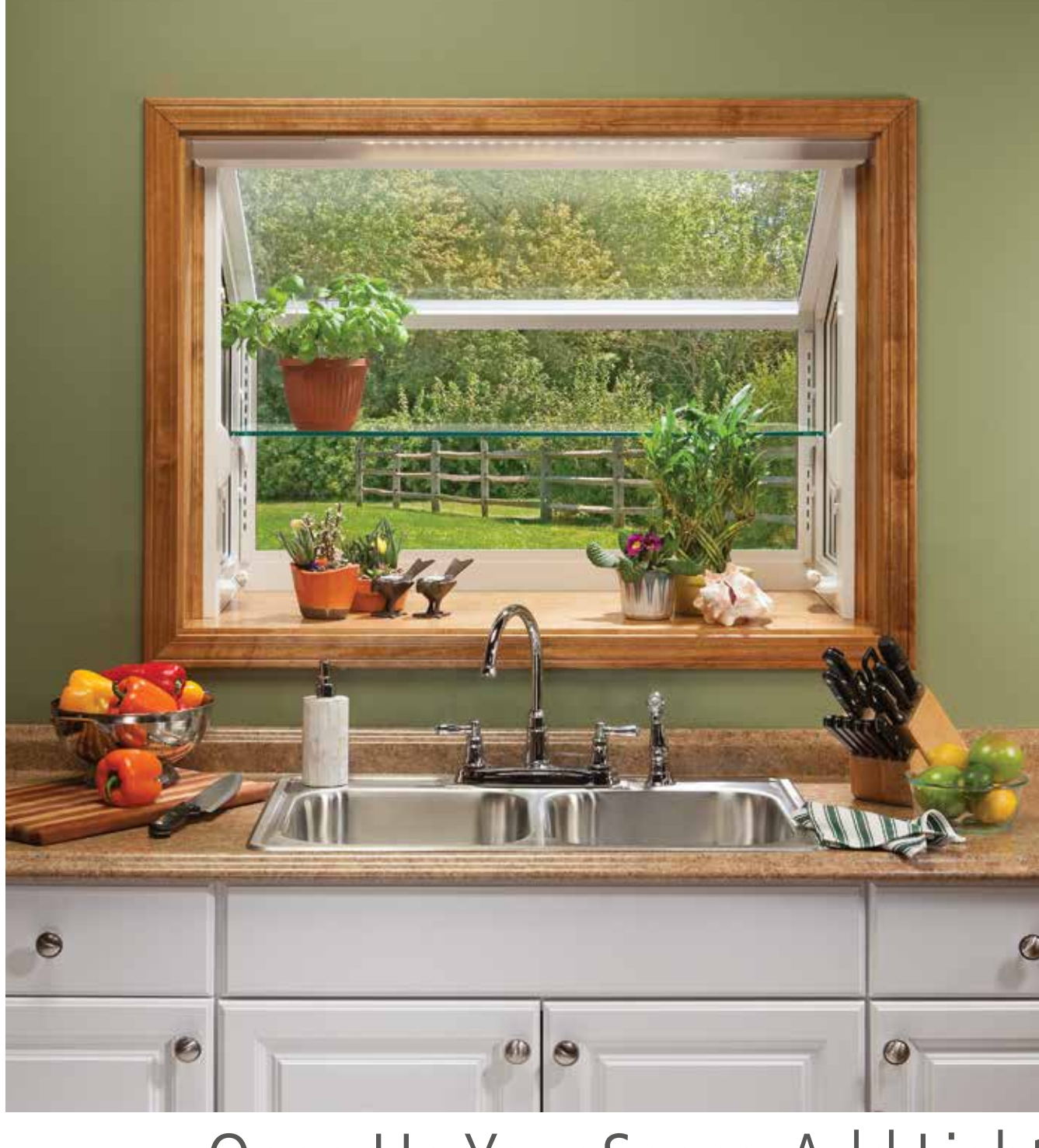
Open Up Your Space, Add Light Series 2050, 2051 and 2050i Garden Windows