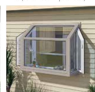
Cocoa (Series 2050i Impact-Rated) Champagne (Series 2050 Standard) Custom Paint (Series 2050i Impact-Rated)